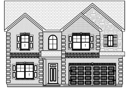
B ELEVATION - BRICK