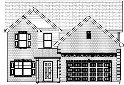
B ELEVATION - BRICK