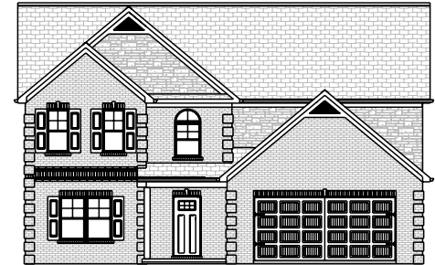
B ELEVATION - BRICK