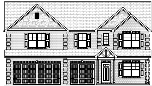
B ELEVATION - BRICK