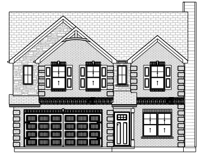
B ELEVATION - BRICK