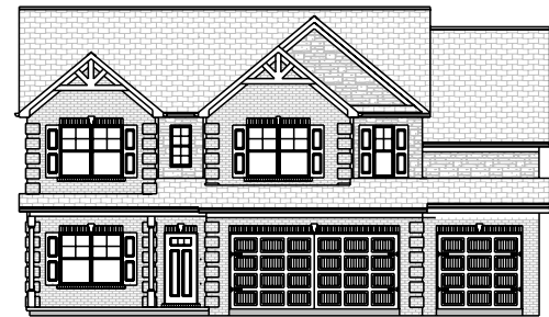
B ELEVATION - BRICK